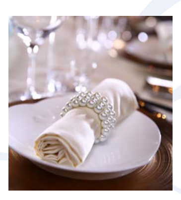
Indulge in an exquisite culinary voyage 尽享精致美食之旅

Let the celebrated team of culinary masters at The Ritz-Carlton, Chengdu design a menu tailored to your celebration's venue, decoration and theme. Admire these master chefs' artistry as you savor hand-made masterpieces which showcase ingredients flown in fresh from around the world. After all, what better way is there to celebrate a perfect day than with a perfect meal?