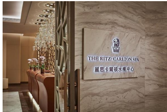
The Ritz-Carlton Spa, Macau is awarded another Five-Star rating in recognition of its premium natural products, personalized treatments, and elegant and luxurious environs.