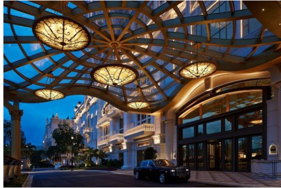
The Ritz-Carlton, Macau awarded a Five-Star rating in Forbes Travel Guide 2024