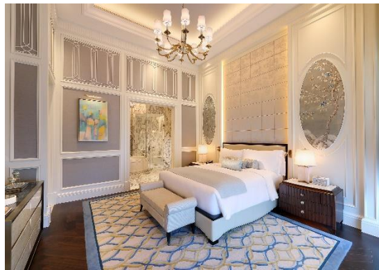
This year marks The Ritz-Carlton, Macau's eighth consecutive Five-Star designation from the Forbes Travel Guide