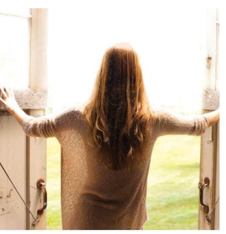
EXHALE'S TRANSFORMATIONAL PACKAGES + JOURNEYS

Immerse yourself in wellness with dedicated programs crafted by exhale's experts. Find flawless skin, reshape your body, define your diet, and restore your mind with proven curriculums. Our knowledgeable teachers, therapists, and healers join you on your journey and guide you to your goals. Get ready to revive, restore, and transform.